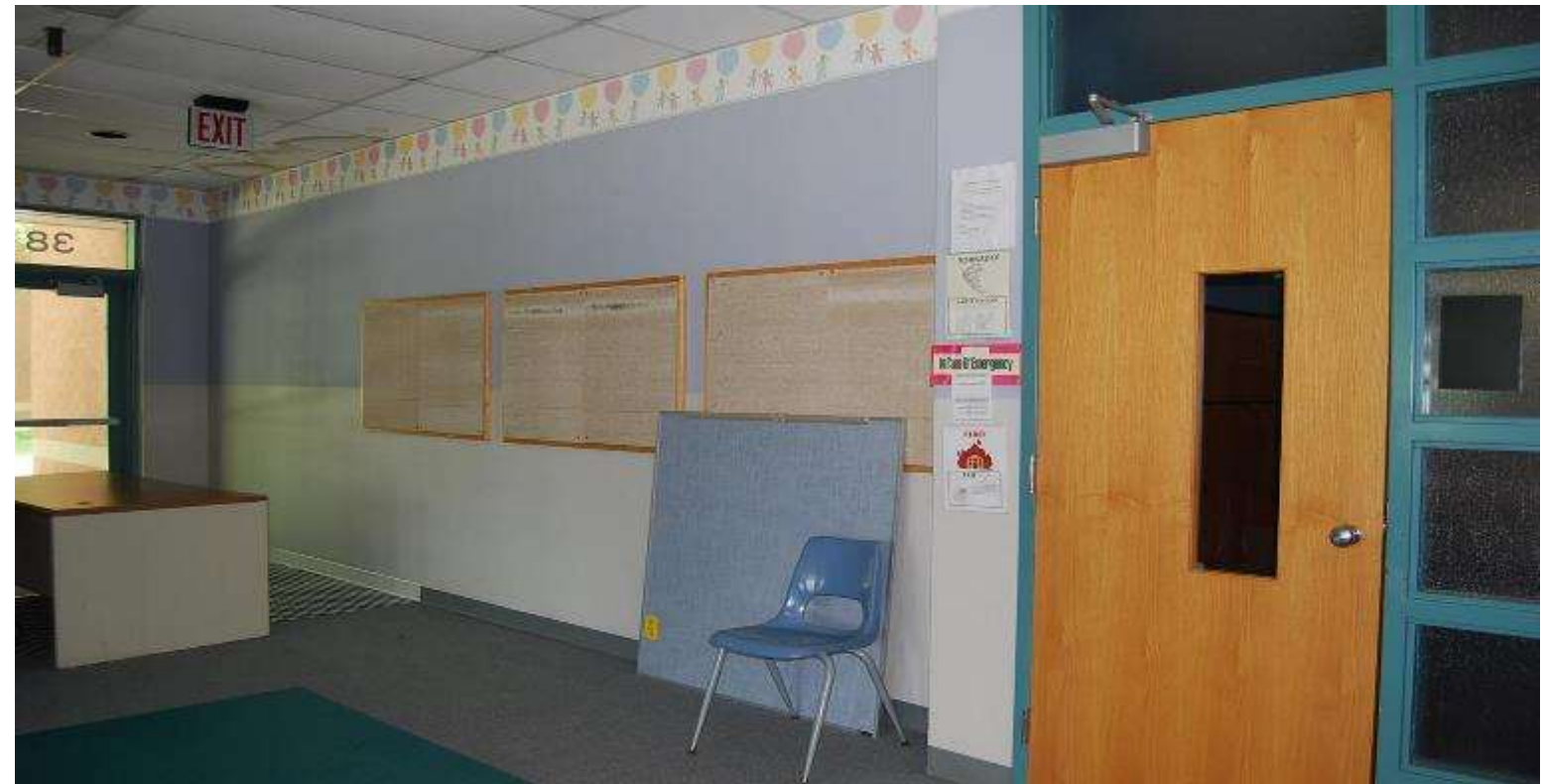
PHOTOS OF EXISTING CONDITIONS